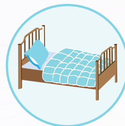
Going to bed