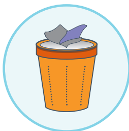
Touching rubbish or anything dirty