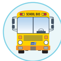
You get home from school