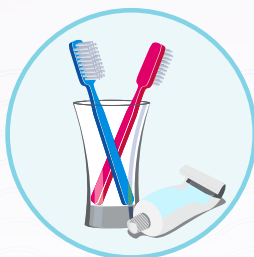
Cleaning your teeth