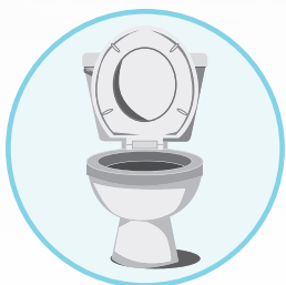
You've been to the toilet