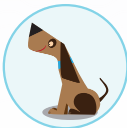
Touching pets or animals