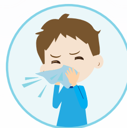
You've sneezed, coughed or blown your nose